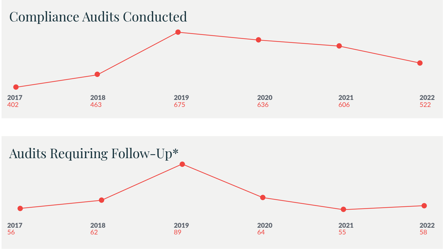
*Audit Referrals to Professional Conduct for 2022 is an estimate

All law firms are subject to accounting and reporting standards set out in the Law Society Rules. Every firm must file an annual trust report and is subject to compliance audits. Every law firm that handles trust funds is audited at least once every six years, or every four years for areas of practice considered to be at elevated risk. Except for a brief period shortly after the provincial health emergency was declared in March 2020, the Law Society was able to fulfil this important part of its public interest mandate through remote audits and the use of virtual technologies.